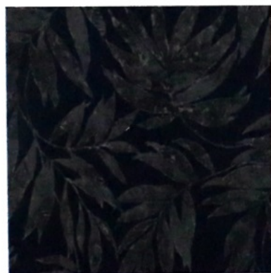
1012-4 / 64p