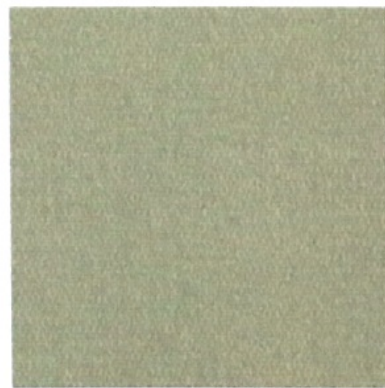
1013-1 / 55p