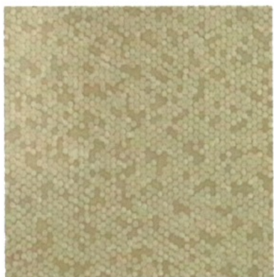
1011-2 / 17p