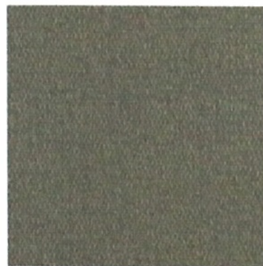
1013-2 / 61p