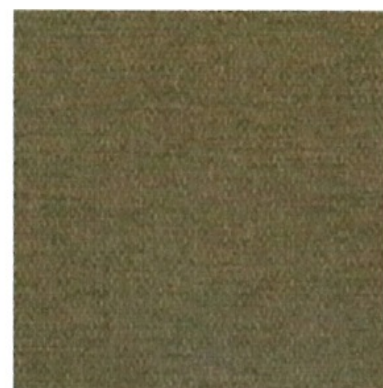
1013-3 / 58p