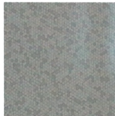
1011-5 / 16p