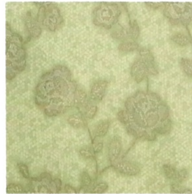
1010-3 / 20p