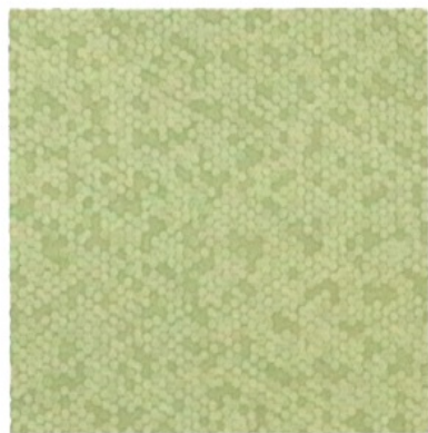
1011-3 / 19p