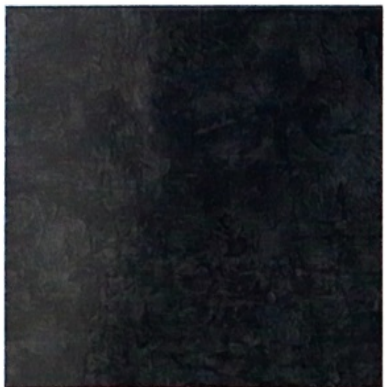
1009-5 / 25p