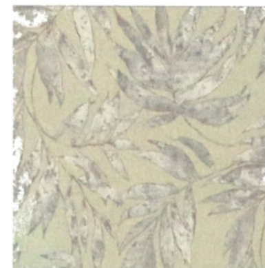
1012-1 / 56p