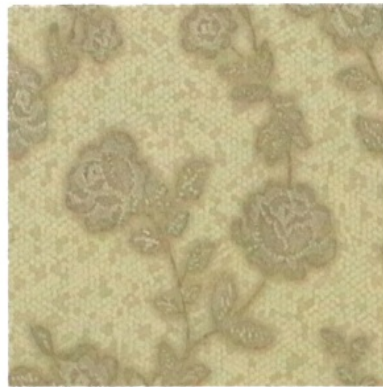
1010-2 / 18p