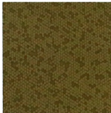
1011-4 / 12p