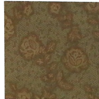
1010-4 / 11p